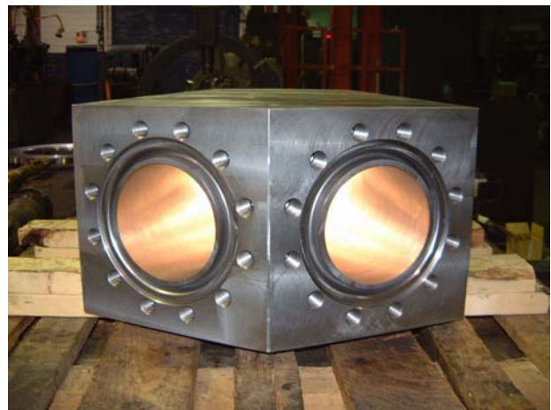
Smooth blending of flow ports